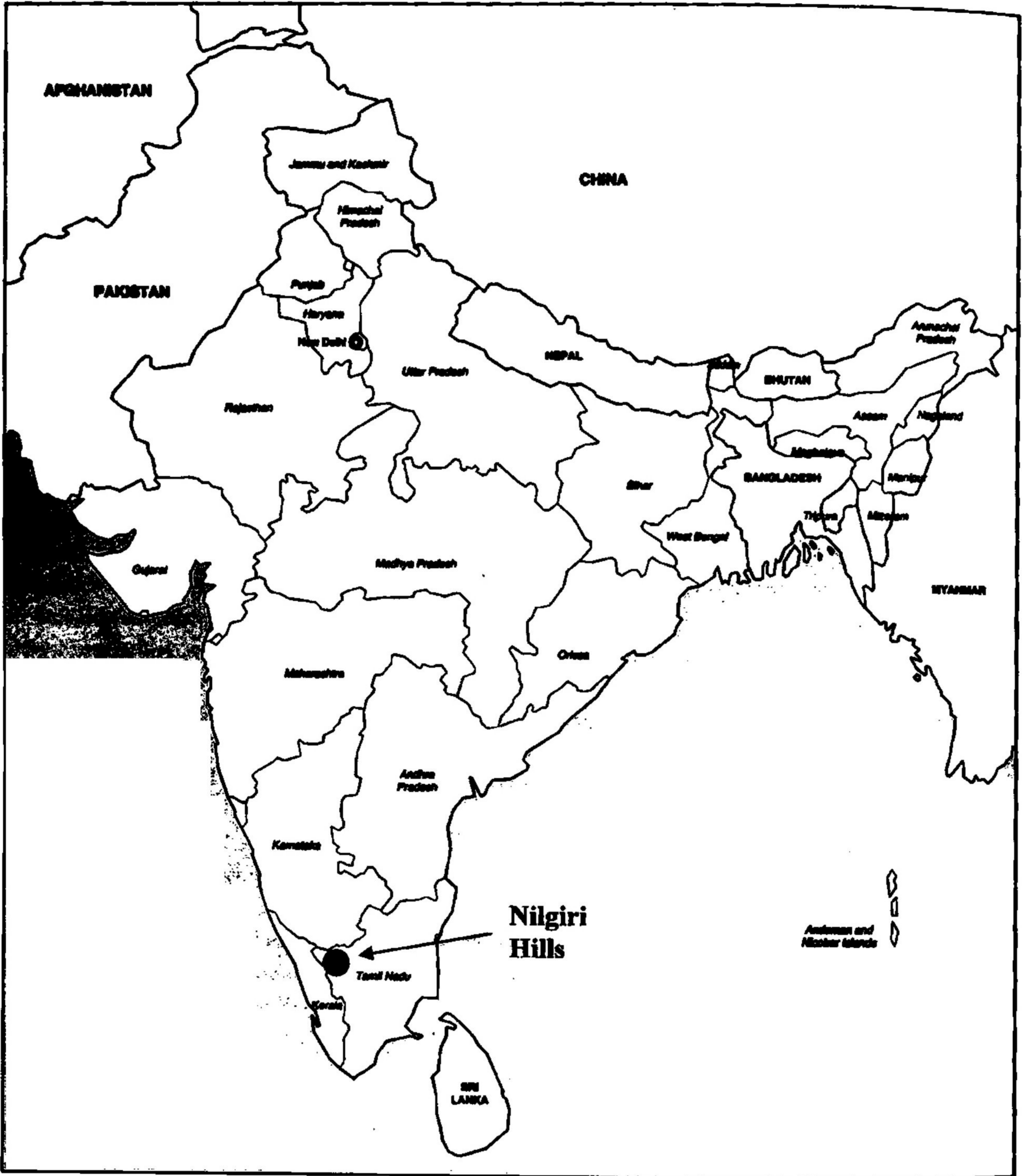
Figure 1 Map of India pinpointing the Nilgiri Hills of Tamil Nadu, in southern India.

samples were subjected to electrophoresis at 125 V for 1 hour. Ethidium bromide stained gels were visualized by UV and were documented.