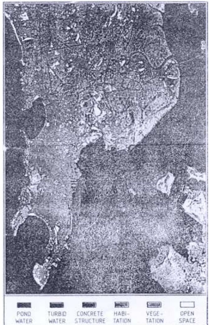
Figure 3. Bombay classified (clustered) image.