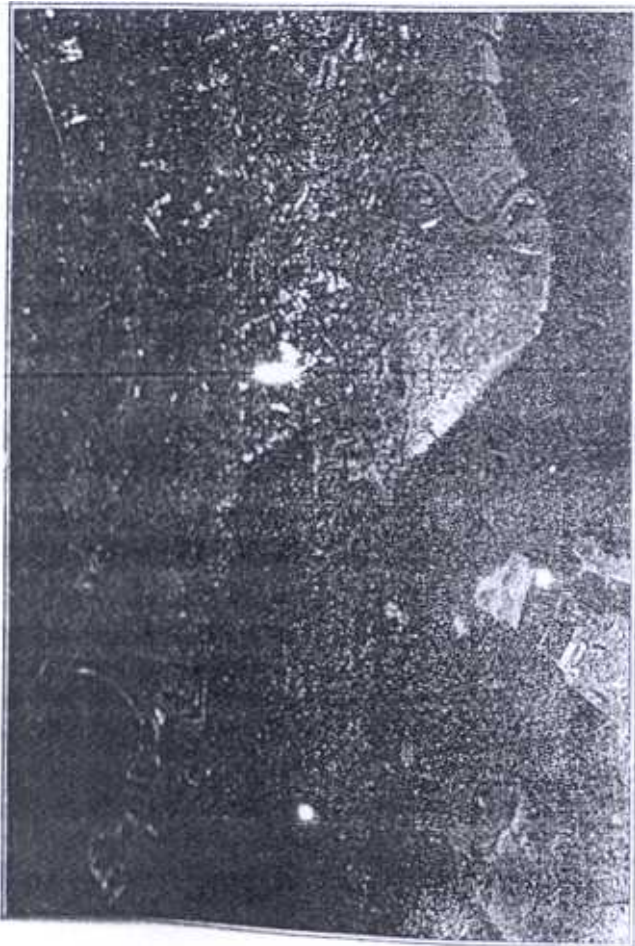
Figure 2. IRS Bombay band-4 (infrared) image.

We have taken 50 representative samples from each class and used the above multivalued systems 4 to obtain the choices for each pixel. The infrared image of Bombay is provided in Fig. 2. The classified image is shown in Fig. 3, where each pixel reflects the class