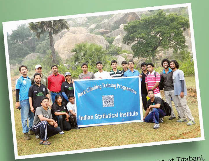
3rd ISI Rock Climbing Training Programme at Titabani, Purulia, W.B. on 15 December 2012