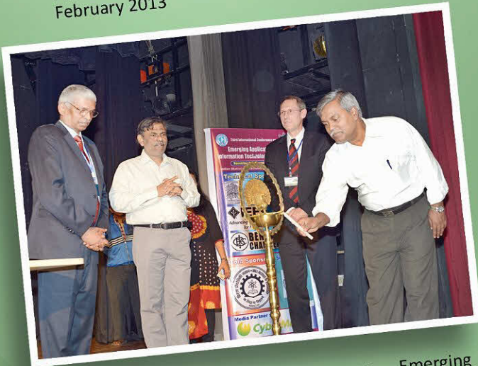
Third International Conference on Emerging Applications of Information Technology organized by ECSU on 30 September 2012