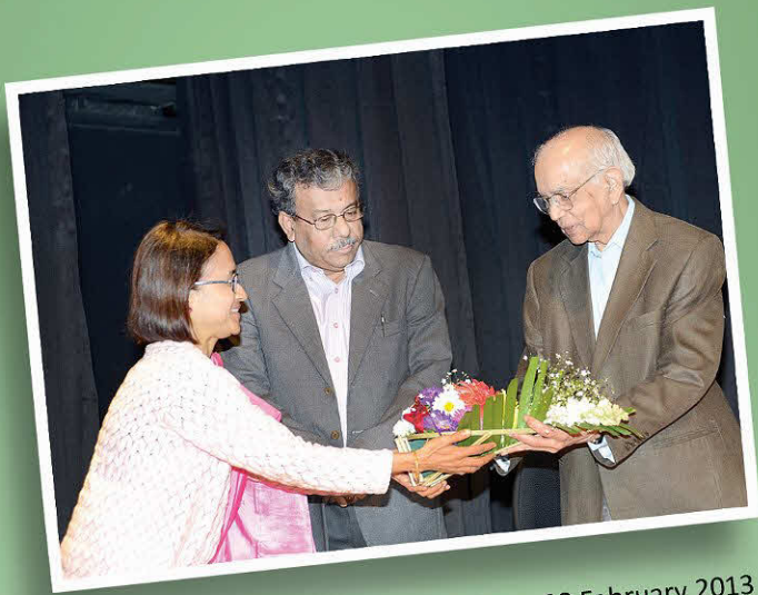
Felicitation of Prof. C R Rao at ISI on 22 February 2013