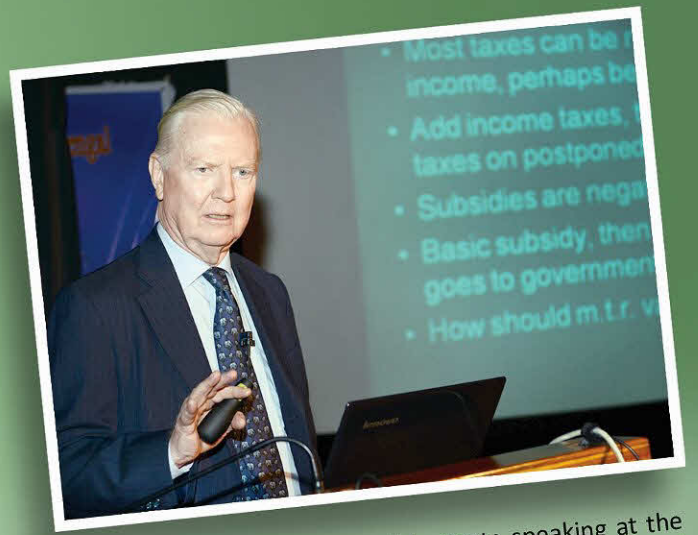
Sir James A Mirrless, Nobel Laureate speaking at the Second Workshop on Economic Growth in West Bengal organized by SOSU on 7 January 2013