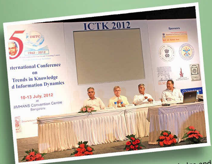
International Conference on Trends in Knowledge and Information Dynamics organized by ISI Bangalore Centre during 10-13 July 2012