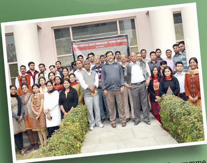
Indian Statistical Probationer's Training Programme organized by SOSU, ISI Kolkata on 01 February 2013