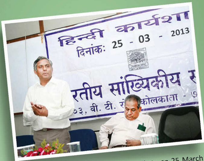
Hindi Workshop organized by ISI Kolkata on 25 March 2013