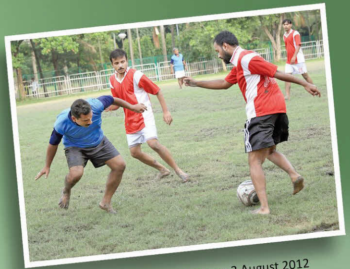
Football match of ISI students on 2 August 2012