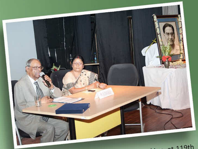
Dr. C. Rangarajan, President of ISI, speaking at 119th Birth Anniversary of Prof. Prasanta Chandra Mahalanobis