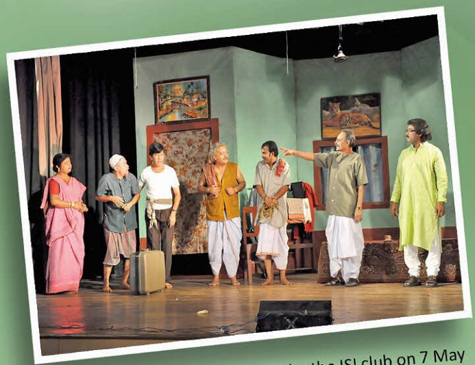
Drama competition organized by the ISI club on 7 May 2012