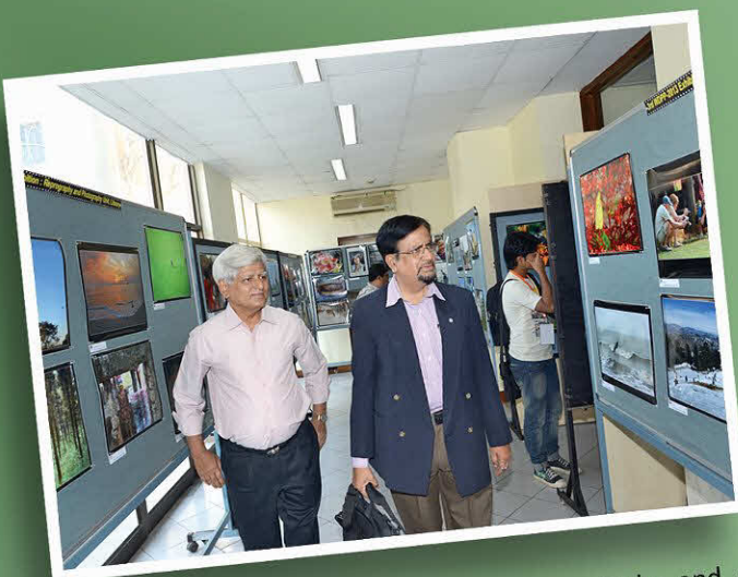
3rd Workshop on Digital Pictorial Photography and a Photographic Exhibition organized by Reprography and Photography Unit at ISI during 04-08 March 2013