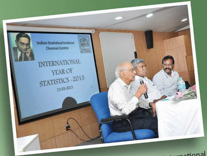
Professor C R Rao delivering lecture in International Year of Statistics-2013 at ISI Chennai Centre on 23 March 2012