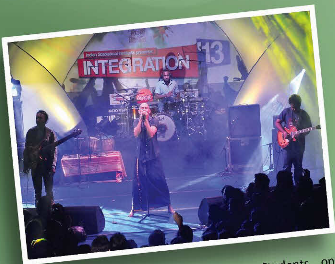
Integration 2013 organized by ISI Students on 12 January 2013