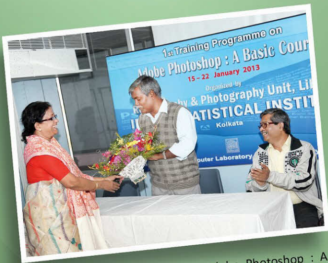
1st 'Training Programme on Adobe Photoshop : A Basic Course' organized by Reprography and Photography Unit, Library during 15-22 January 2013