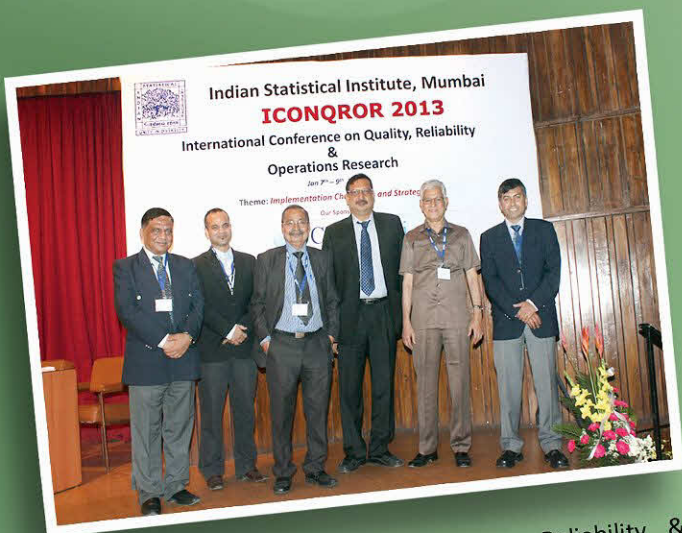
International Conference on Quality, Reliability & Operations Research organized by SQC&OR, Mumbai on 7 March 2013