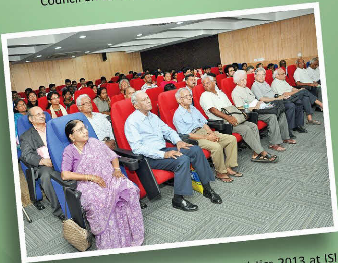
Celebrating International Year of Statistics-2013 at ISI Chennai Centre on 23 March 2012