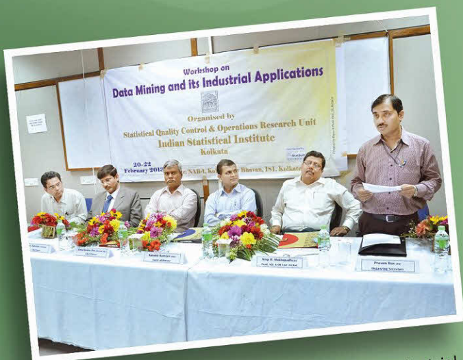
Workshop on Data Mining and its Industrial Applications organized by SQC-OR Unit at ISI during 20-22 February 2013