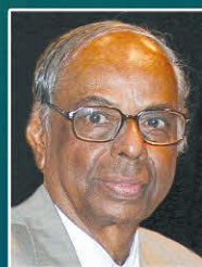
President : Dr. C. Rangarajan