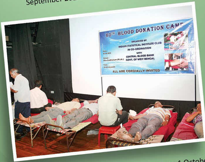
Blood Donation Camp organized by ISI club on 1 October 2012