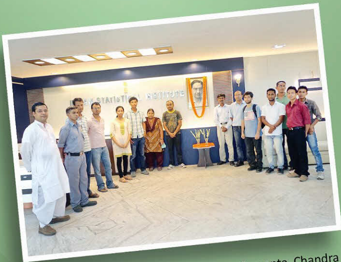
119th Birthday celebration of Prof. Prasanta Chandra Mahalanobis at ISI Tezpur Centre on 29 June 2012