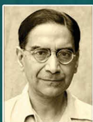
Founder : Professor P. C. Mahalanobis

The Institute has a distinguished faculty in statistics, mathematics, computer science, economics and other disciplines of natural and social sciences. Many of them are fellows of Indian National Science Academy, Indian Academy of Sciences, Indian National Academy of Engineering, National Academy of Sciences, India, Institute of Electrical & Electronics Engineers (IEEE) and many other distinguished scientific societies in India and abroad, as also recipients of prestigious awards like S.S. Bhatnagar Prize, Homi Bhaba Award etc.