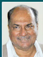
Chairman : Shri A.K. Antony