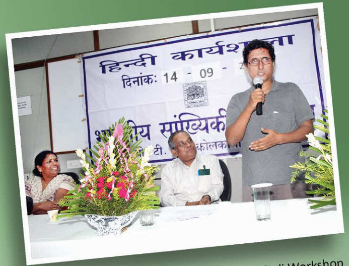
Prof. Ayanendranath Basu speaking at Hindi Workshop organized by ISI on 14 September 2012